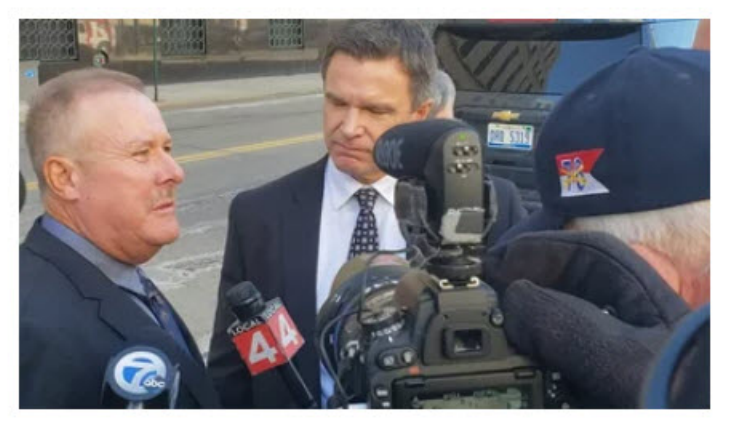
UAW SCANDAL | UPDATED 12 HOURS AGO