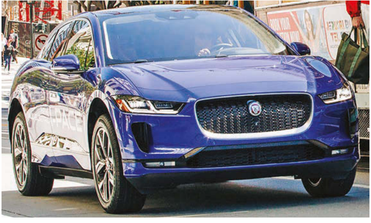
Jaguar beat rivals to market in battery-powered crossovers with the I-Pace.

The United States District Court for the Eastern District of Michigan, Southern Division