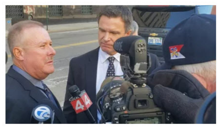
UAW SCANDAL | UPDATED 12 HOURS AGO