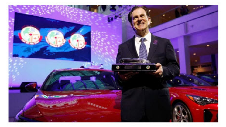
EXECUTIVES | UPDATED 6 HOURS AGO

Click here for more information. www.AutoPartsAntitrustLitigation.com/AutomotiveBrakeHoses