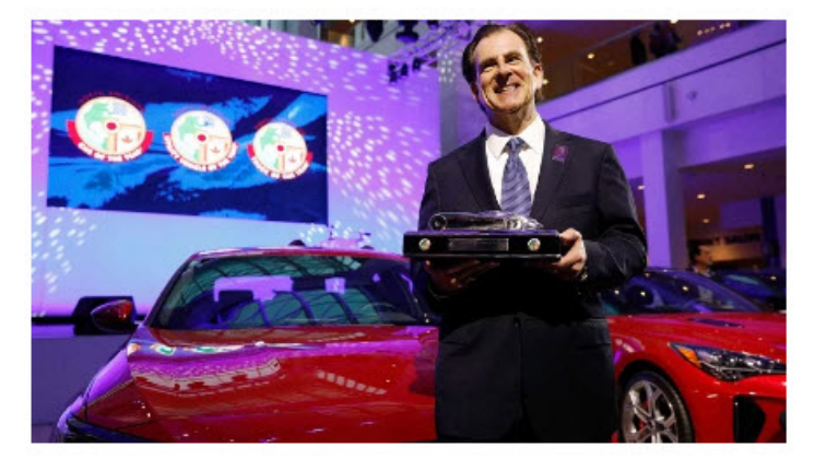
EXECUTIVES | UPDATED 6 HOURS AGO

$4,991,667 in Direct Purchaser Settlements reached with Automotive Brake Hoses Manufacturers in Price Fixing Class Action Lawsuit